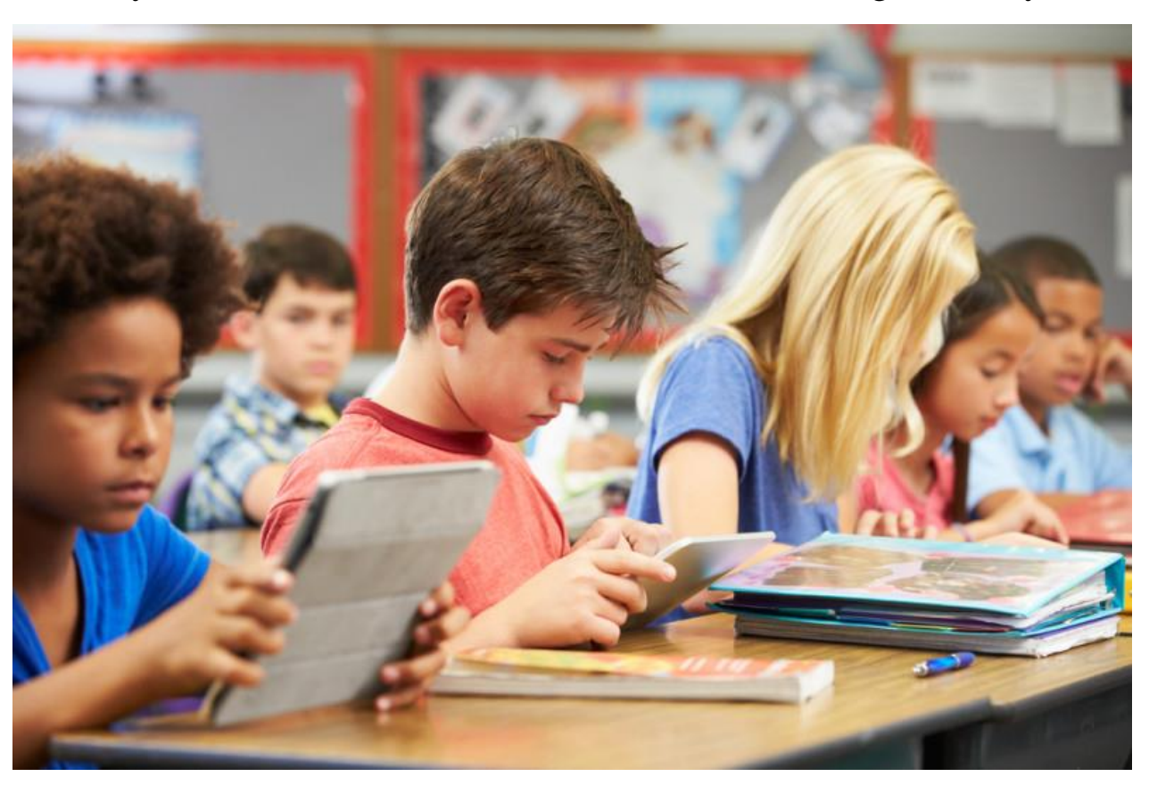
Use Forms and Checklists

From Individualized Education Programs (IEPs) to lesson plans to student work portfolios, one of the easiest ways to keep yourself ahead is to make sure all of your <u>paper writing help</u> work is organized. Filing cabinets, folders, and binders are especially useful. The exact organization technique that works will differ from teacher to teacher, but if you start with a system, it will be much easier to maintain it throughout the year.